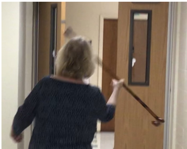
"One of my goals was to leave here twirling my cane!"