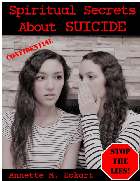
The book that's setting people free