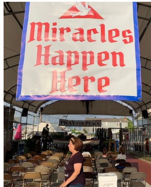
Setting up boardwalk ministry in Freeport