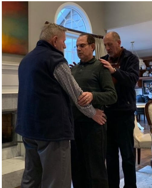
Foundation for Healing practical training