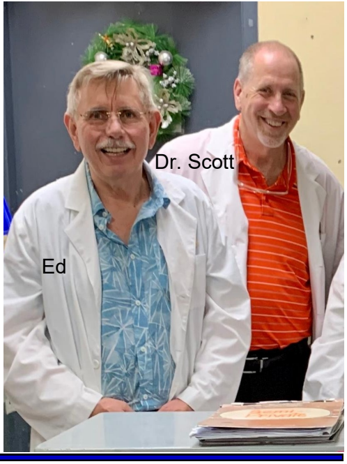
(Continued from page 3)

not an action of one with a sound mind. Therefore, I wore all my protective devices and was careful regarding personal hygiene.