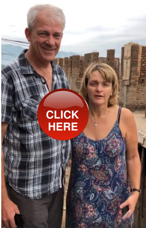
Update on school project