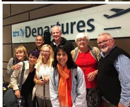
Mission accomplished...till next time!