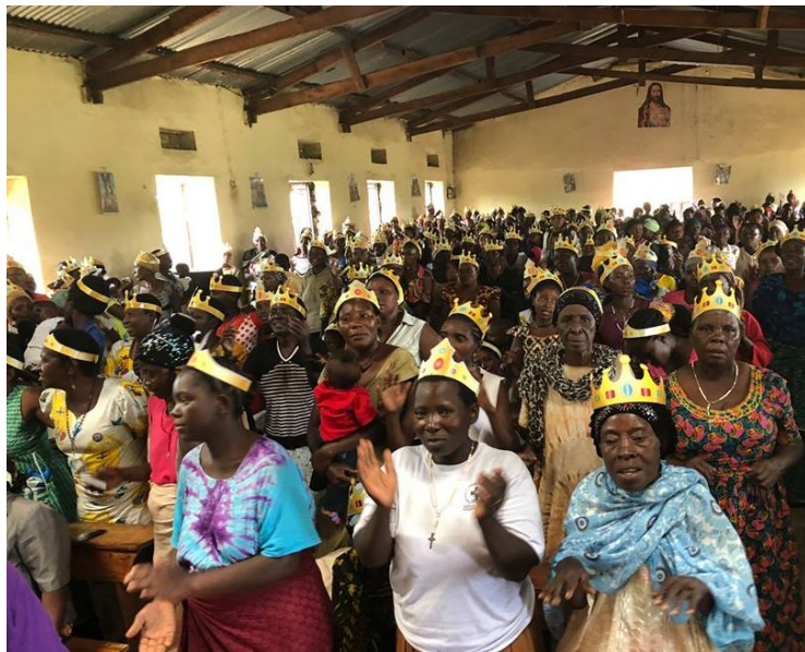
500 attend women's conference