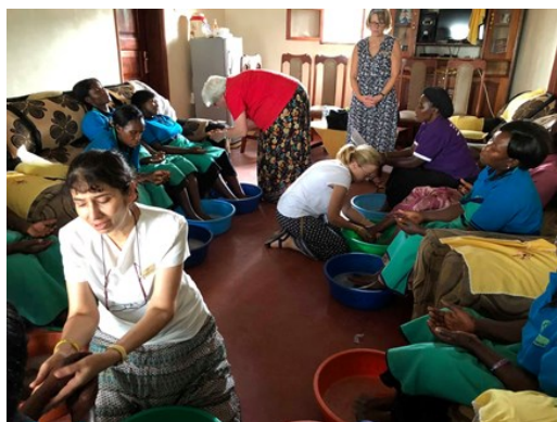
Ministering to CV moms