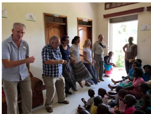
“10, 9, 8...God is Great!”