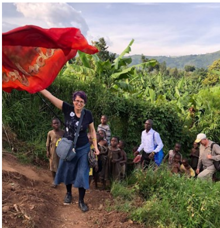
Reaching the heights!

Mail: Bridge for Peace, PO Box 789, Wading River, NY 11792