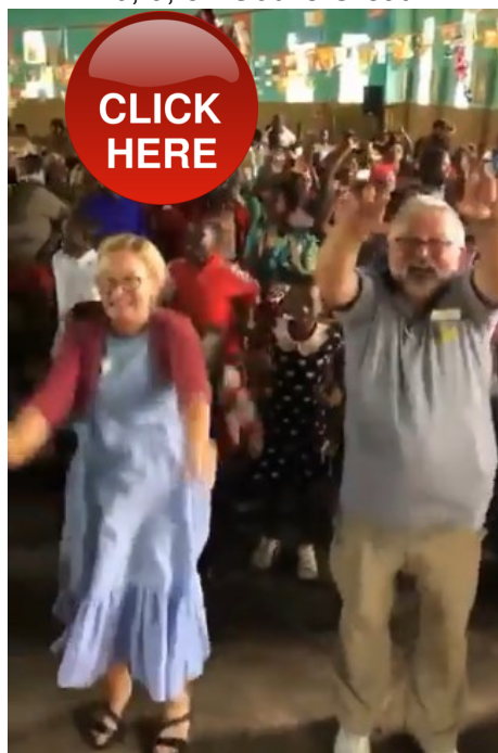
Worship Uganda style!