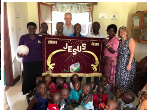
Children's Village banner presented