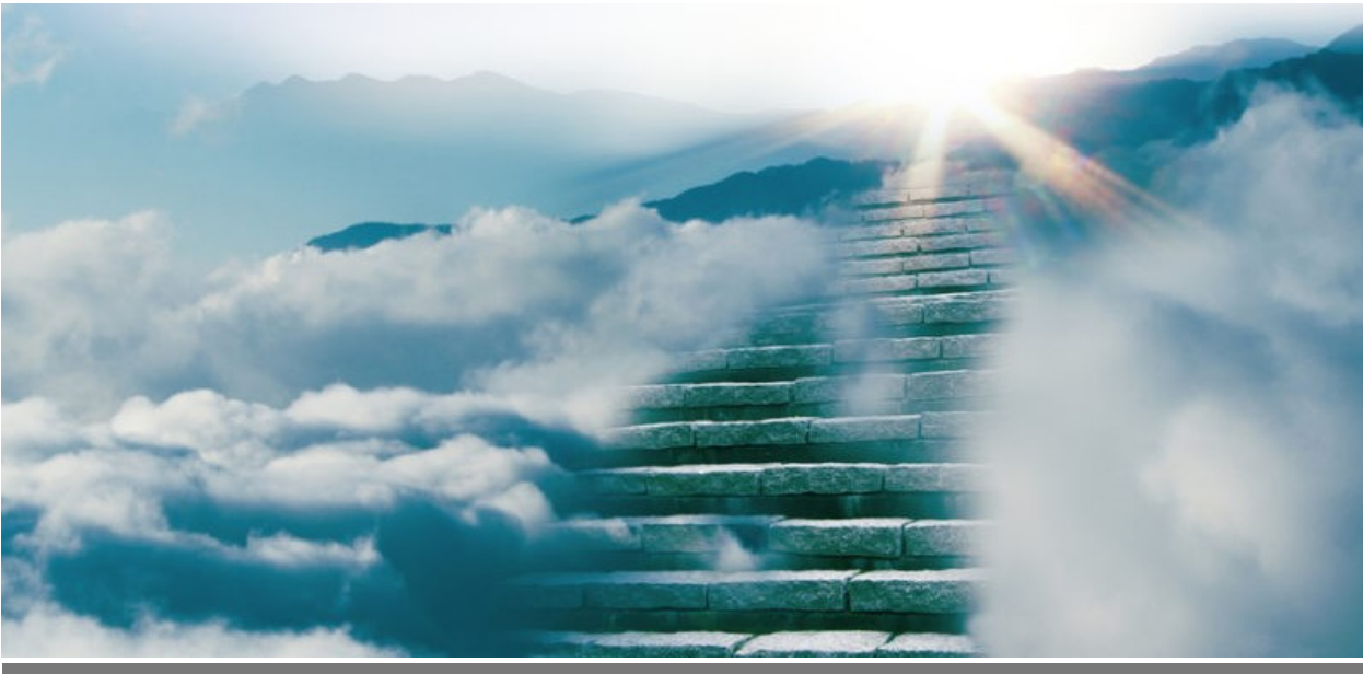
1,2,4 How to Go Higher Embracing a culture of honor and love