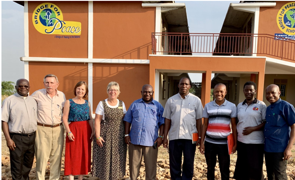
Meeting with the B4P International School board