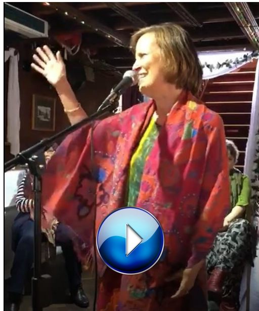
Napean River Cruise Message