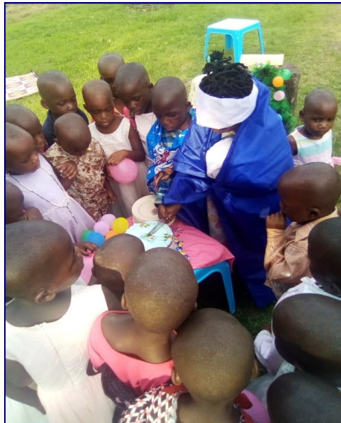
"Mary" with baby Jesus cuts the cake