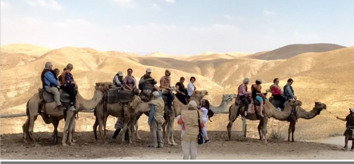
1-2 Patience! Savlanut! "Because in Israel you need a lot of patience"